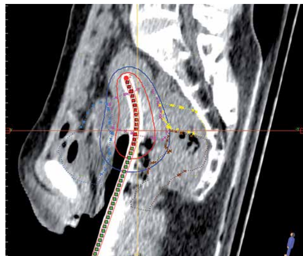
Fig. 2. Dose distribution using point A plan Blue dots – bladder, pink dots – HR-CTV, yellow dots – sigmoid, brown dots – rectum, HR-CTV – high-risk clinical target volume